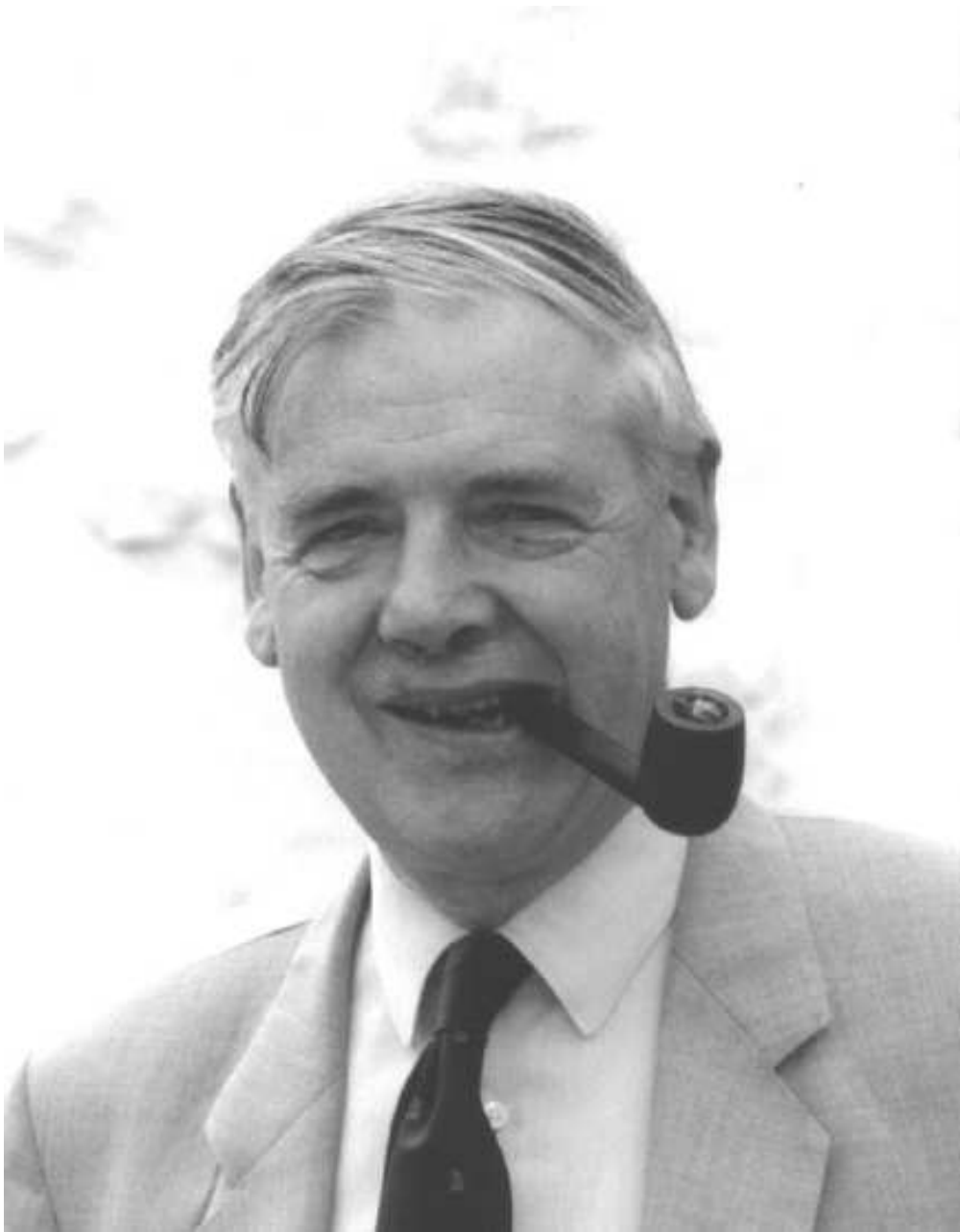
JOHN MICHAEL HAMMERSLEY